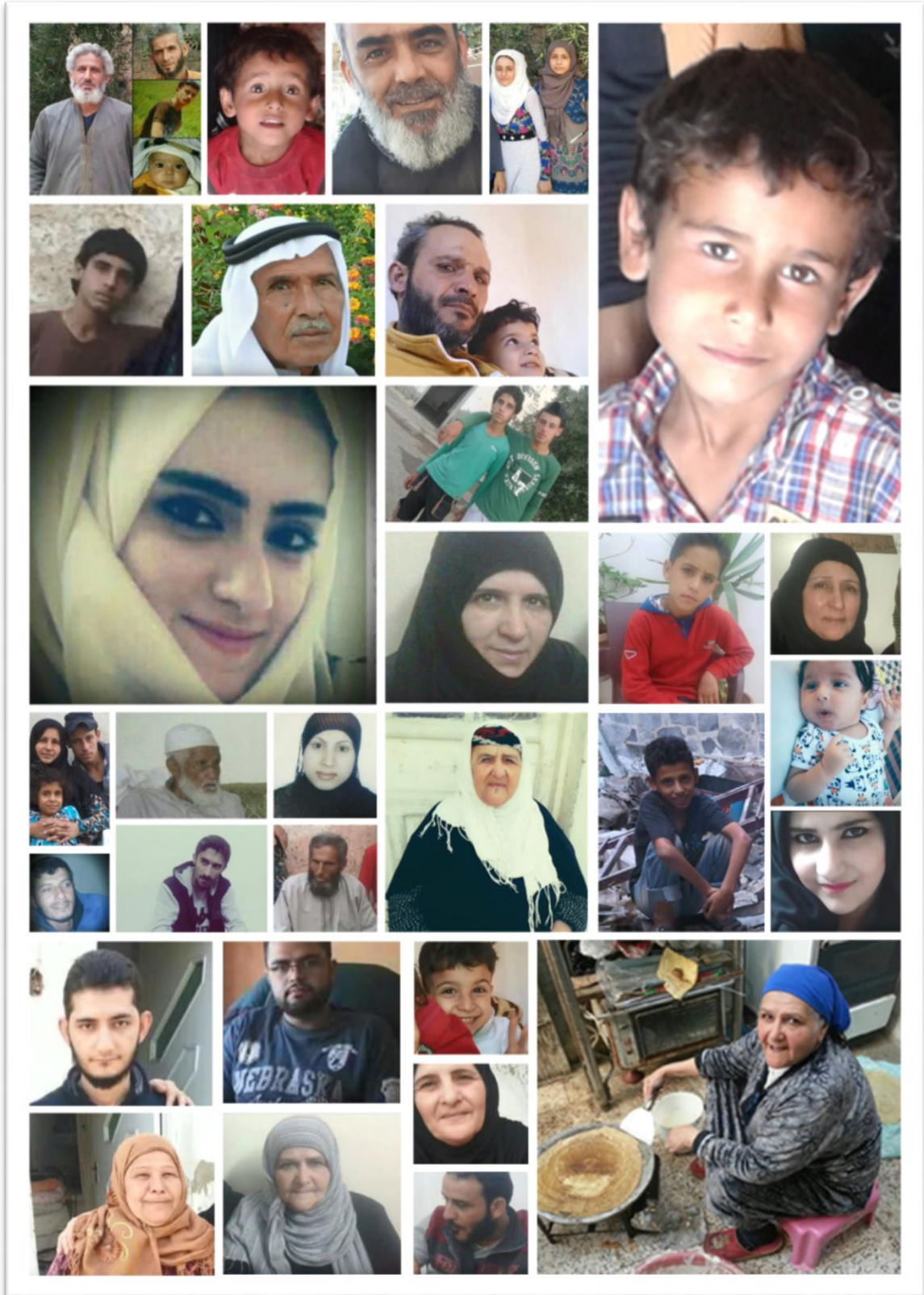
Members of the Badran family killed in three separate Coalition air strike on 18 July and 20 August 2017 in Raqqa.