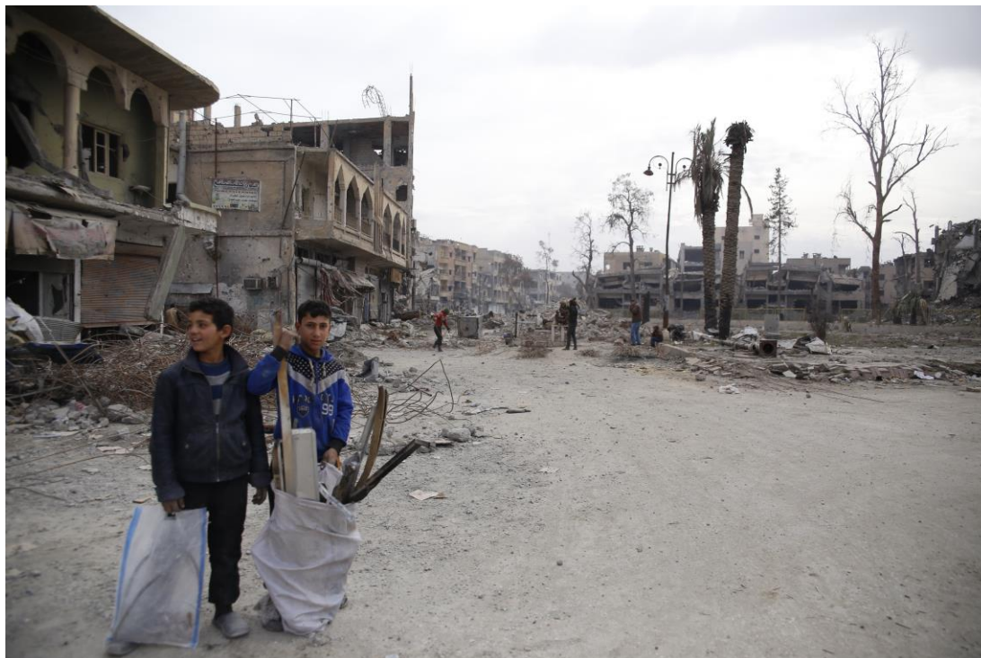
Children scavenging for scrap metal in the rubble of destroyed buildings in Raqqa, where many of the buildings were mined by IS and where children and adults are frequently killed and injured by mines.

Daily labourers and scavengers are sometimes referred to as “unofficial de-miners” because they risk their lives working in the rubble of bombed-out buildings which may be mined. A local businessman told Amnesty International: