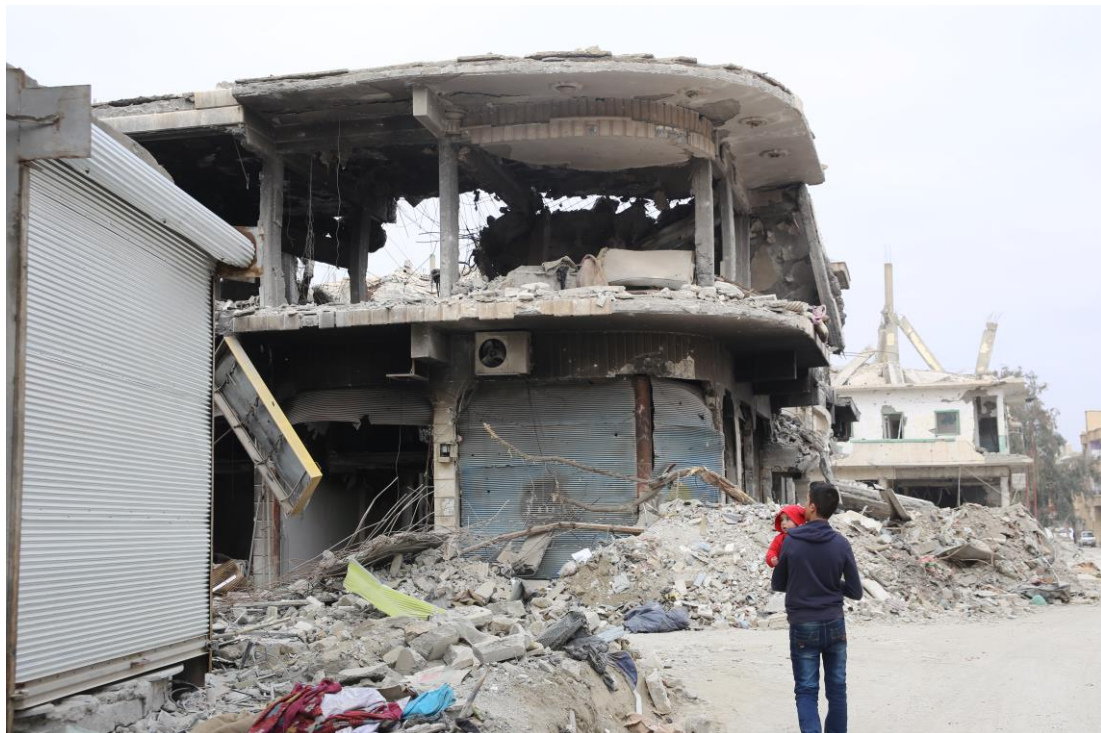
A young man holding a child staring at the ruins of bombed buildings in Raqqa.

Seven were killed and the rest were injured. Most of the dead and injured were women and children. The survivors had no option but to return home. A few days later a Coalition air strike destroyed their home, killing nine members of the family, mostly women and children.