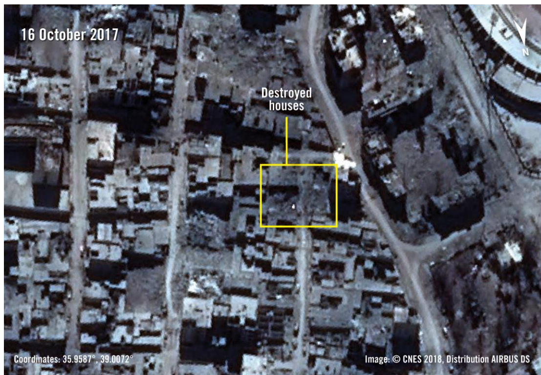
Satellite images showing the houses where 16 members of the Fayad family and neighbours were killed in Coalition strikes on 12 October 2017, before and after the strike.