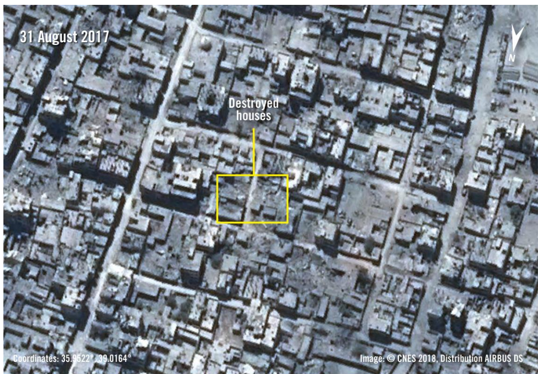
Satellite images showing the house where 28 members of the Badran family and five neighbours were killed in a Coalition strike on 20 August 2017, before and after the strike.