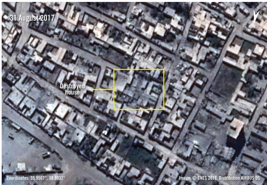
Satellite images showing the house where nine members of the Hashish family were killed in a Coalition strike, before and after the strike.