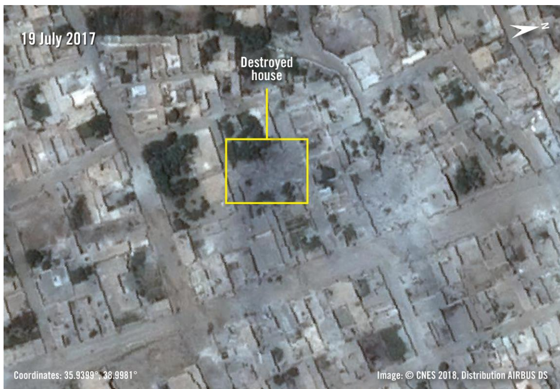
Satellite images showing the house where seven members of the Badran family were killed in a Coalition strike on 18 July 2017, before and after the strike.