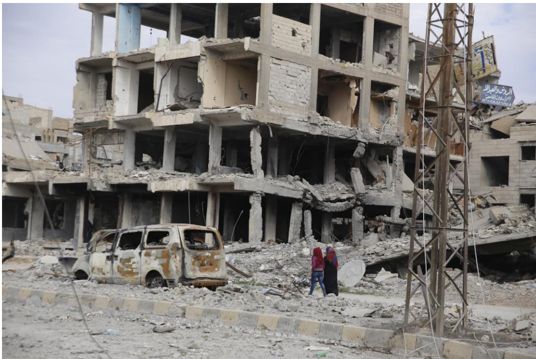
Women walking in rubble-strewn street past destroyed buildings in Raqqa.

Amnesty International’s August 2017 report also detailed IS abuses against civilians during the battle for Raqqa, particularly IS’s use of civilians as human shields as the conflict got underway and the group redoubled efforts to prevent residents from leaving the city. IS laid mines/IEDs to slow advancing SDF forces and to render exit routes impassable, 7 set up checkpoints around the city to prevent residents from leaving, and its snipers shot and deliberately killed civilians who tried to escape. 8 As the SDF captured neighbourhoods and front lines shifted within the city, IS forced residents to move deeper into areas which remained under its control.