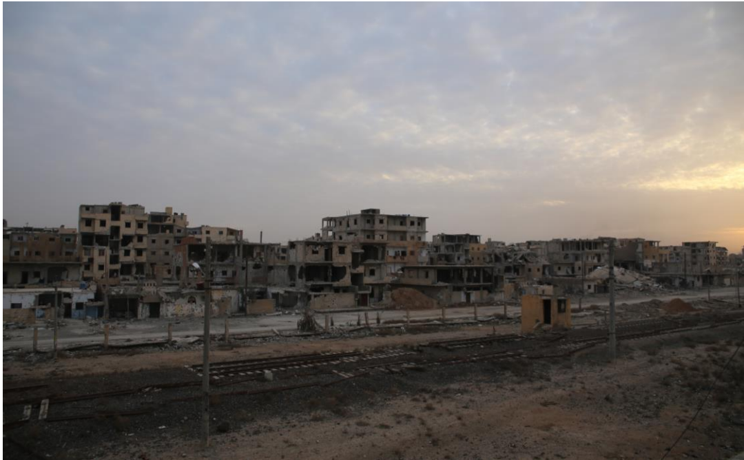
Destroyed neighbourhood in Raqqa.

strikes, at the time that the military operation was still under way. 105 A Coalition official dismissed the concerns raised by Amnesty International and by the UN Special Advisor on Syria, who had called for a pause in hostilities to allow civilians out of the city. 106 The Commander of Coalition forces, Lieutenant General Stephen Townsend acknowledged that, after an escalation in attacks, “it is logical to assume there has been some increase in civilian casualties” , before going on to cast doubt over Amnesty International’s findings, saying, “I would ask someone to show me hard information.” 107 He further stated: “I think we are being as careful as we need to be and as we can be, and I would challenge the individual from the UN who made this hyperbolic statement that civilian casualties are staggering. Show me some evidence of that.” 108 US Defense Secretary James Mattis’ only response was: “We are the good guys and the innocent people on the battlefield know the difference.” 109