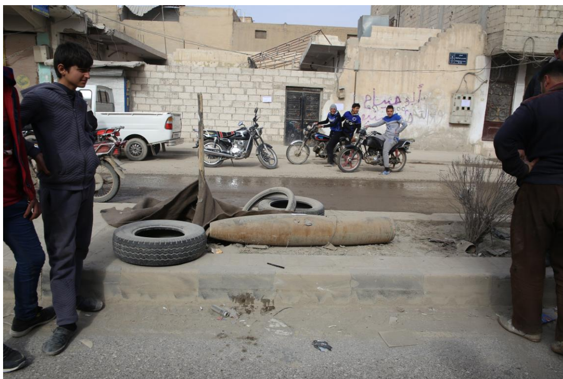
Unexploded MK 82 bomb, dropped by the Coalition, in a street in the centre of Raqqa. Months after the recapture of Raqqa unexploded munitions still littered Raqqa, in places where they posed a threat to civilians and where they could have easily been removed.