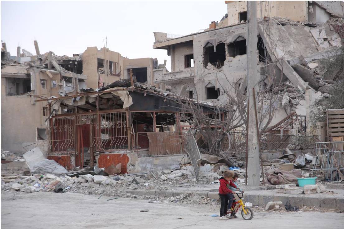
Children riding a bicycle among destroyed buildings in Raqqa.

aware of any Coalition investigators having visited any strike sites anywhere in the city or having interviewed survivors or witnesses of other strikes. Such shortcomings in the investigation methodology appear to be a significant contributing factor to its dismissal of almost all the reports of civilian fatalities and casualties. 122