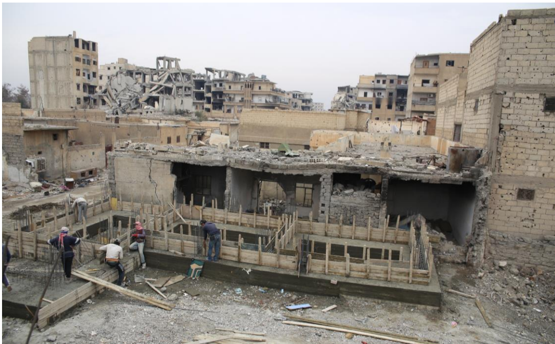
Workmen are rebuilding the Fayad family home, which was destroyed in a Coalition air strike on 12 October 2017 in Raqqa.

A plane came and targeted the taps as there was a crowd there. The crowd was mixed between civilians and IS. Water was not available at the well every day and when it was available it would only come on for two hours at a time – from 8-10am and then again between 3-4pm. That's why there was a crowd at the well. When I came to the scene I found my son with a shrapnel wound in his shoulder. I took him to the National Hospital and waited two hours while he bled to death. They [IS] told us there were no doctors and no one with expertise. 74