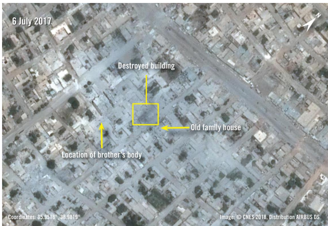
Satellite images showing the Aswad family's building before and after it was destroyed in a Coalition air strike which killed eight civilians, five of them children, on 28 June 2017.