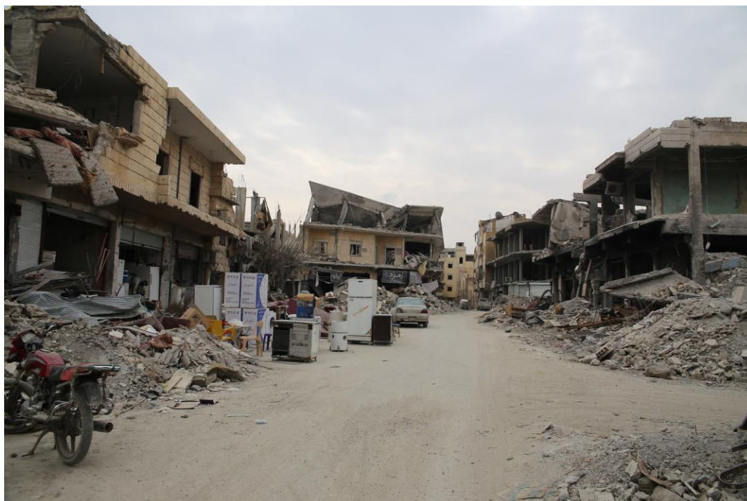
A shop selling household goods in the midst of destroyed buildings in Raqqa. Many business people, complain that their shops and warehouses were looted after they left the city.

back to Raqqa immediately after the battle but the SDF did not allow residents back then because they said there were mines planted by Daesh. But now, after everything has been looted, residents are allowed to come back even though there are still mines everywhere and people get blown up every other day by these mines. 140