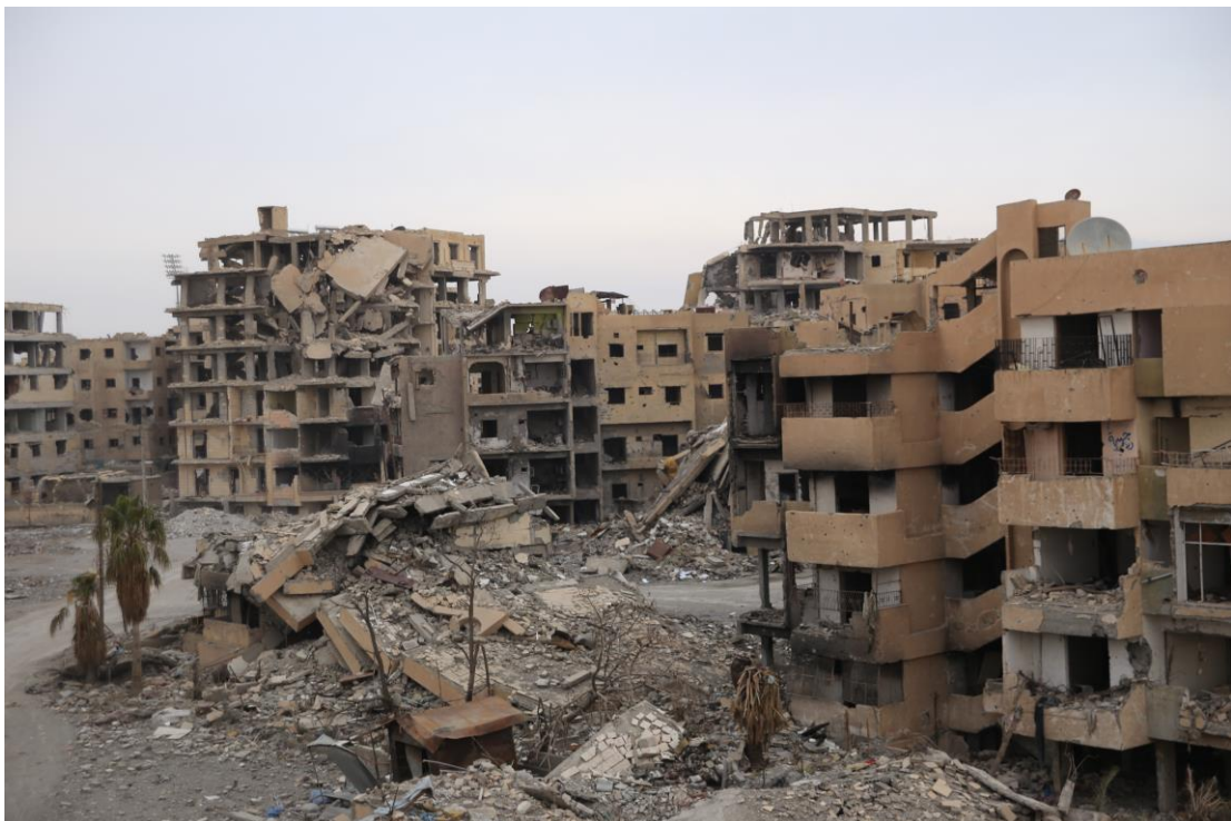
Entire neighbourhoods in Raqqa are damaged beyond repair.

In all the cases detailed in this report, Coalition forces launched air strikes on buildings full of civilians using wide-area effect munitions, which could be expected to destroy the buildings. In all four cases, the civilians killed and injured in the attacks, including many women and children, had been staying in the buildings for long periods prior to the strikes. Had Coalition forces conducted rigorous surveillance prior to the strikes, they would have been aware of their presence. Amnesty International found no information indicating that IS fighters were present in the buildings when they were hit and survivors and witnesses to these strikes were not aware of IS fighters in the vicinity of the houses at the time of the strikes. Even had IS fighters been present, it would not have justified the targeting of these civilian dwellings with munitions expected to cause such extensive destruction.