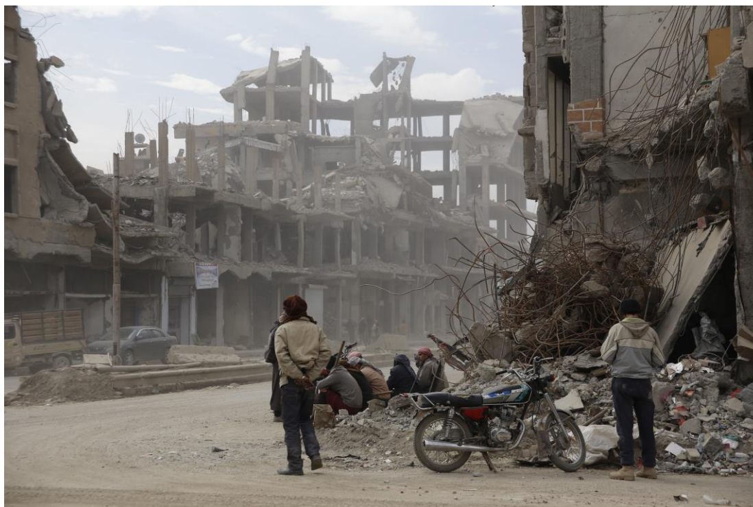
Men wait by the side of the road for casual labour in Raqqa. Many end up clearing partially destroyed or damaged buildings, a very risky endeavour as many buildings were mined by IS and civilians are frequently killed and injured by mines.