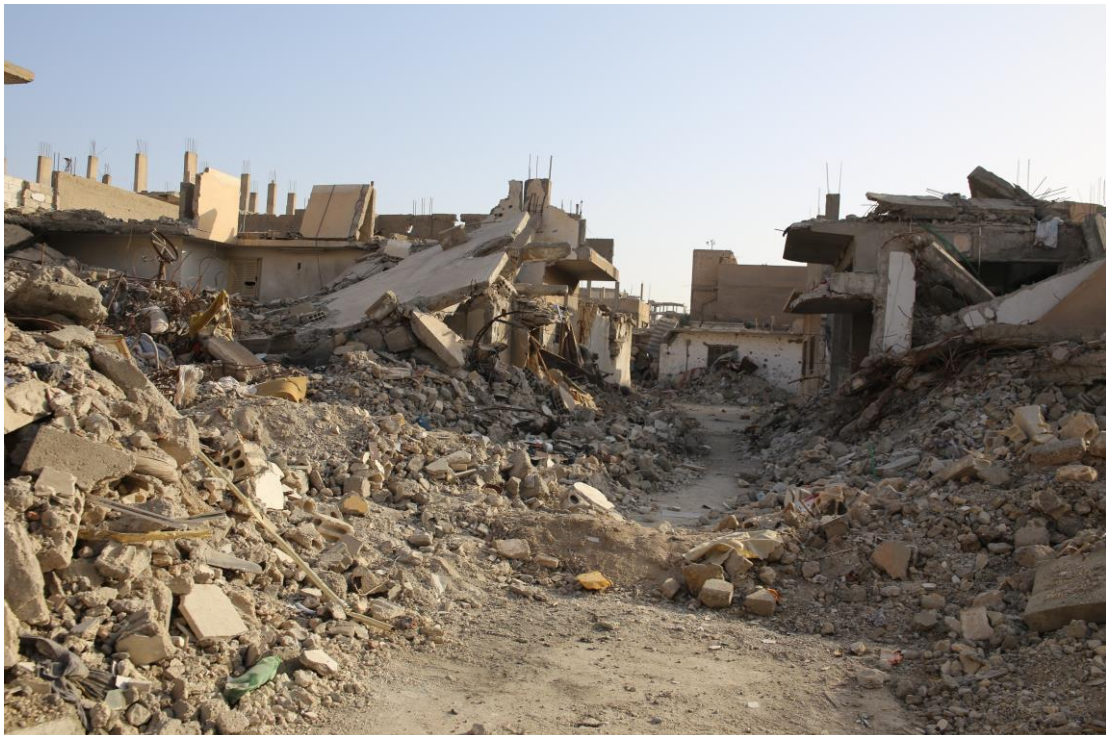
The ruins of the destroyed house where 28 members of the Badran family and five neighbours were killed in a Coalition strike on 20 August 2017 in Raqqa.

We went to Sharia al-Mansour and we took shelter in a two-storey house but after four days there Daesh forced us to move towards al-Fardous and Harat al-Badu neighbourhoods. So we went to Nazlet al-Shehade. On 18 July we fled from there because the fighting was getting closer. As we were fleeing nine of our relatives were killed in two bombardments – five of them in one of the houses just as they were about to leave and four others in the car. We had just left along with the rest of the women and children while the men were still at the house preparing to leave when the house and the car were bombed.