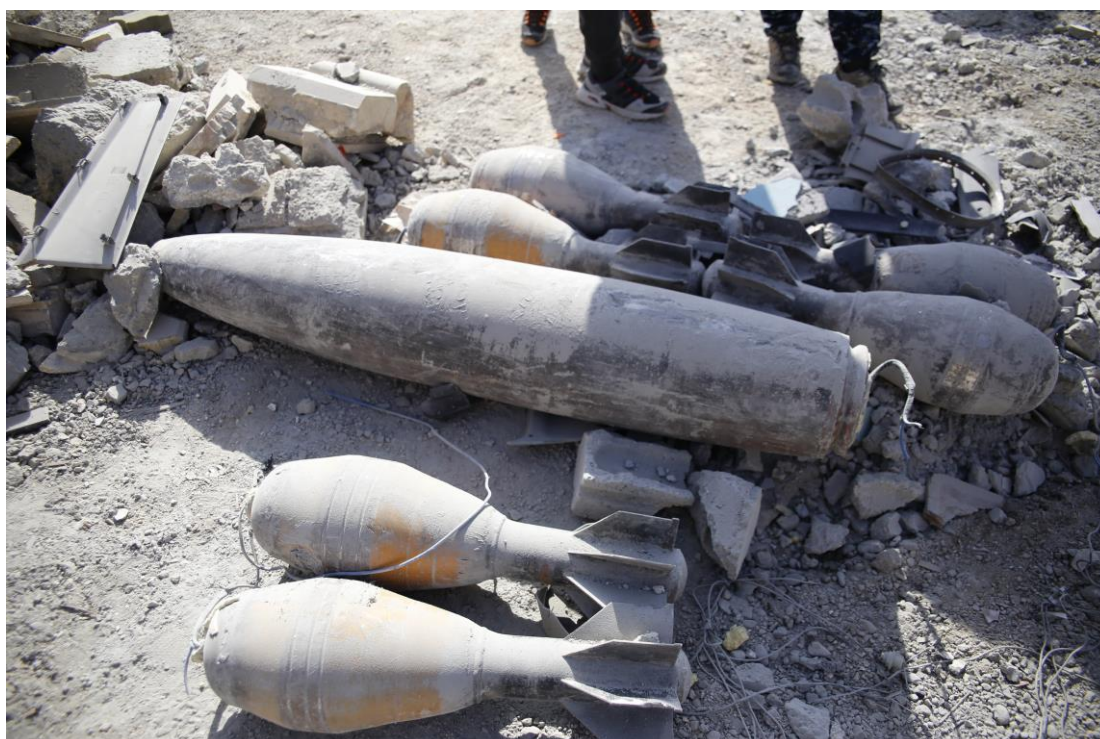
Unexploded MK 82 bomb dropped by the Coalition, which was subsequently rigged by IS and turned into a large IED, surrounded by six mortars locally produced by IS.